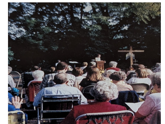
"Sanctuary Without Walls" September 14, 1997